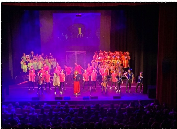
The view from the rafters of this spectacular show